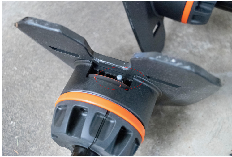
Press the release pin in (circled in red) while turning the selection dial.