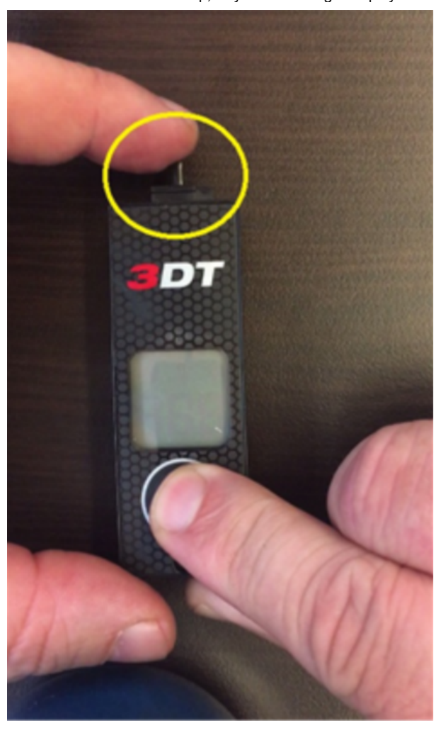
The plunger, circled in yellow, should be able to move freely when pressed.