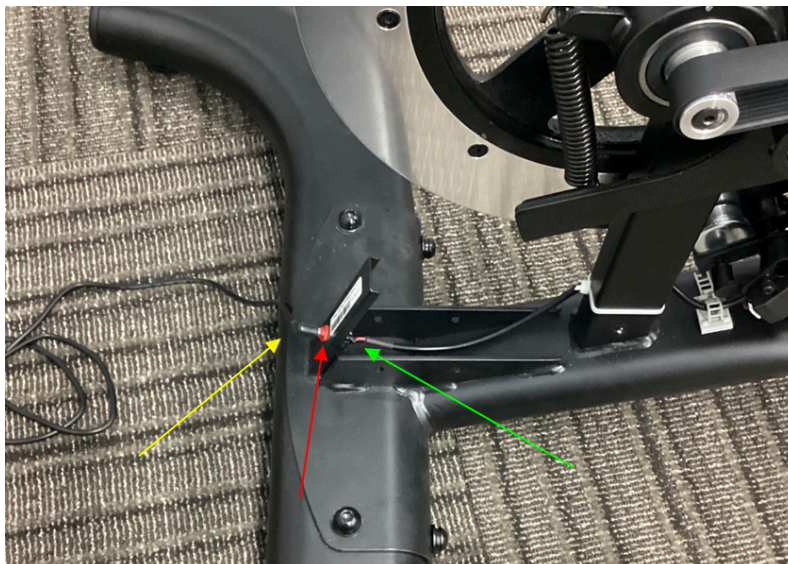
The power inlet is located on the back side of the bike. The component locations are indicated by color-coded arrows: