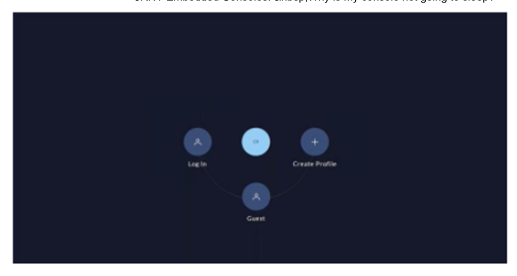
The Log In screen appears after logging out or if you missed the opportunity to access the menu from the previous screen. Tap the upper right corner 10 times within 3 seconds to access the menu to force an update.

2. In the menu that appears, select "Check for updates" (reference 1.3 and 1.4). Allow the updates to download and install. Your machine will restart once all updates are installed. Allow the updates to finish installing once your machine has rebooted.