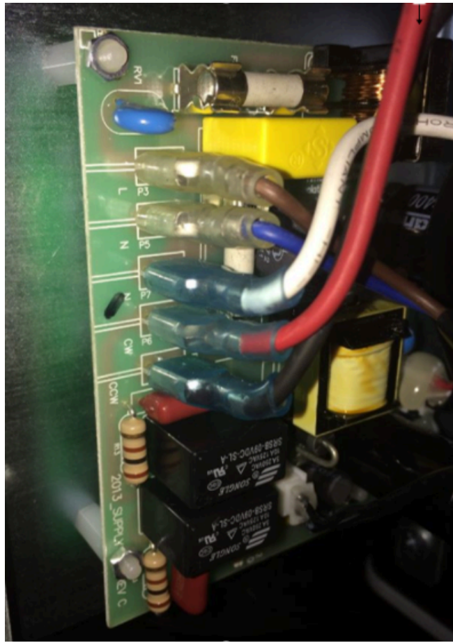
The MCB is pictured - check each cable connected to the MCB for damage and a secure connection.

7. If the issue persists after replacing the MCB, order an Incline Motor [12731.J] .