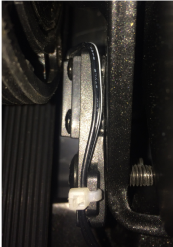
An example of a properly positioned speed sensor and wire.